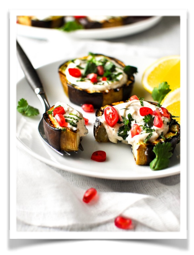
Month 8 - December 2014