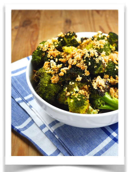
X Avoid yellow and orange tone surfaces.