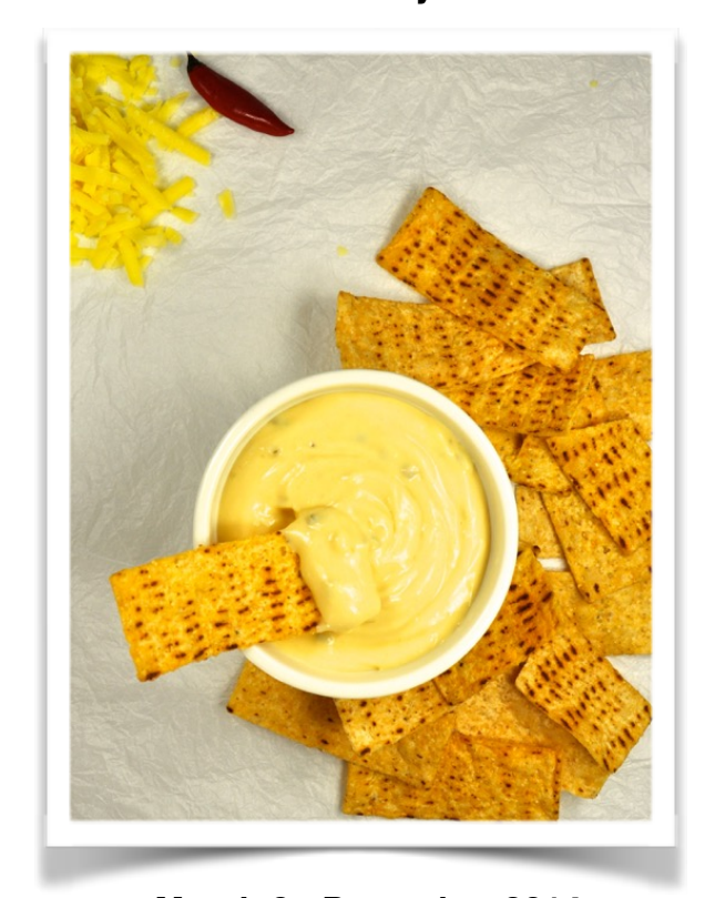
Month 8 - December 2014