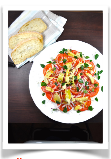
X Avoid shiny laminate surfaces.