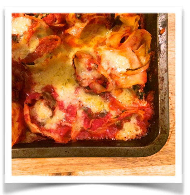
House lights...don't do it!

It is virtually impossible to get correct colour tones on a photo taken under house lights because house lights tend to have warm/yellow tones so it casts a yellow tone over the photos. Fixing the colour balance of photos taken under house lights is challenging even for experienced photographers.