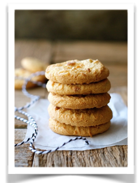
√ Styling can be kept simple when using shooting surfaces with texture.

Cooler colours are easier to use. Avoid yellowy and orange tones. They just aren't flattering and are harder to work with (until you become a pro!). Whites, grey tones and dark colours are easier to work with.