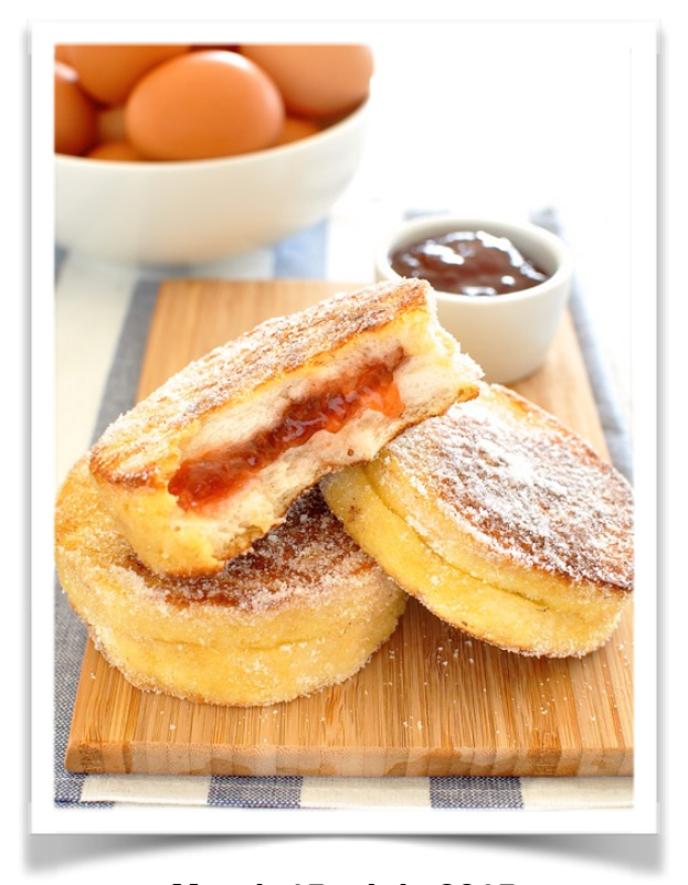
Month 15 - July 2015