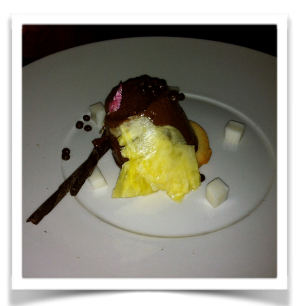
I hit the jackpot with this one - not enough light PLUS flash. Delicious looking!