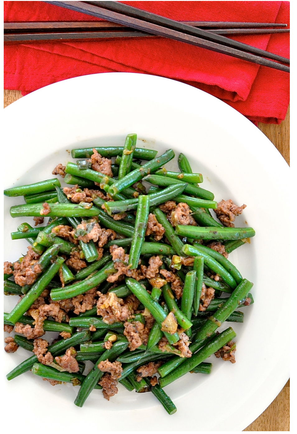
Exclusive to this e-Cookbook

There is a fiery Chinese Szchuen version of this dish. This Japanese version is not as spicy and a lot less oily, plus faster to make.