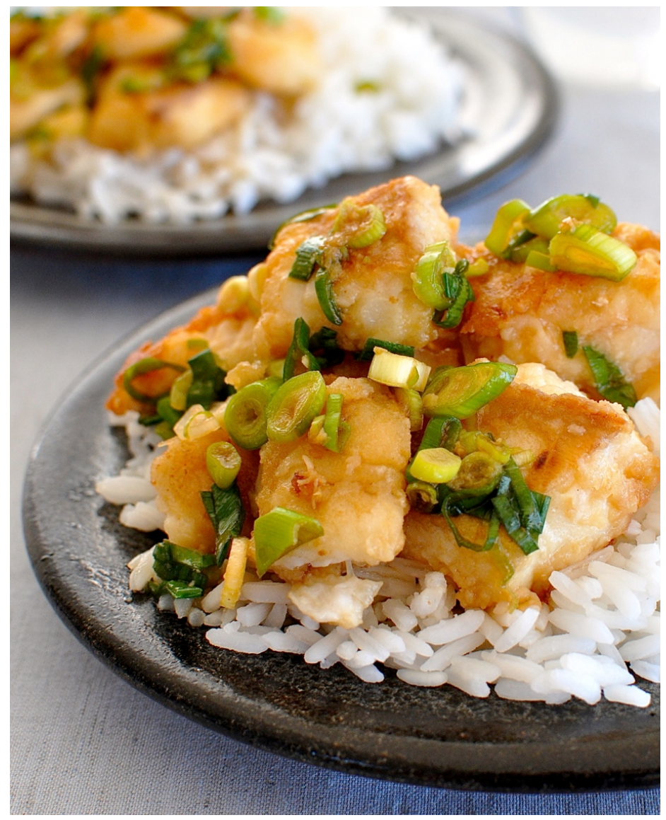
Exclusive to this e-Cookbook

Rarely found outside of Japan, it's hard to believe you can make this delicious dish in just 15 minutes.