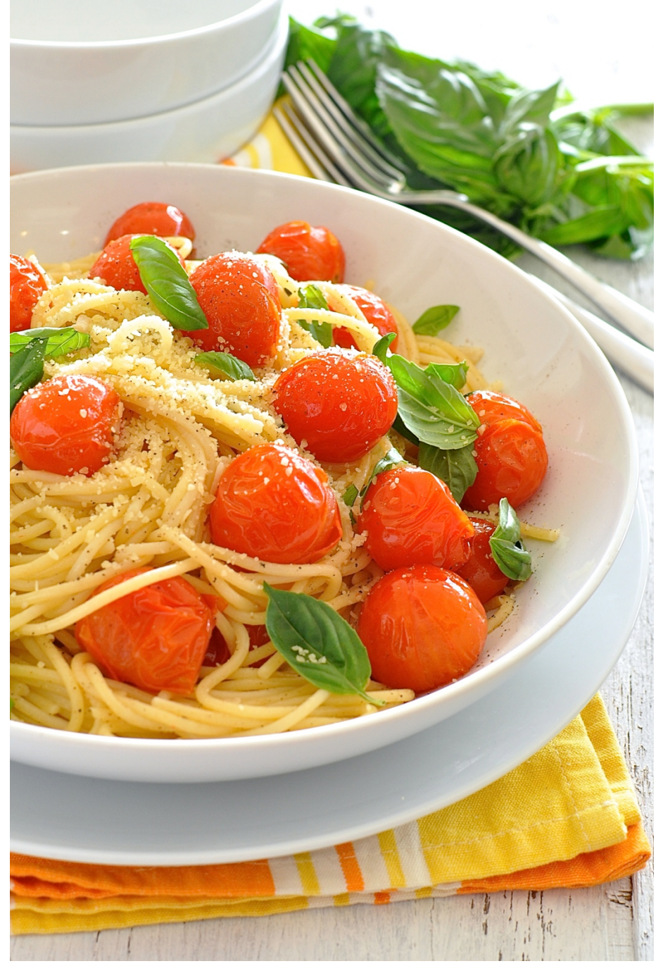
Exclusive to this e-Cookbook