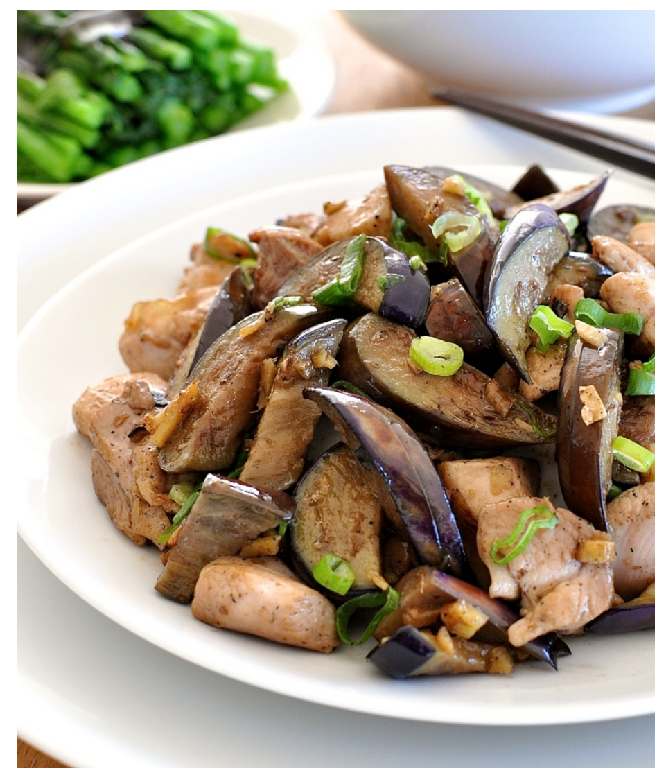
Exclusive to this e-Cookbook

This is a classic Japanese home-cooking meal that is an undiscovered gem in the Western world. It's so simple, but so tasty.